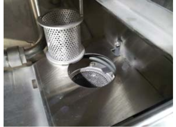
Secondary basket for dumping, primary filter shown in place

8 PUMP FILTERS—Inspect the sump area and verify pump filters are in place. The primary filter is bolted in place and should not be removed by the end-users. If the secondary filter basket is used properly, this will avoid unnecessary cleaning of the primary filter (which should only be cleaned by qualified personnel). The secondary filter basket is used to block the path for picks and straw's through the primary filter holes; it catches and holds solids. The secondary (loop handle) should not be removed before draining the machine. It should be removed and emptied only after the machine is completely drained—like the tray of a scrap box. Verify that chemical feed lines are in their proper container and that lines are primed. Post an operational wall chart close to the machine.