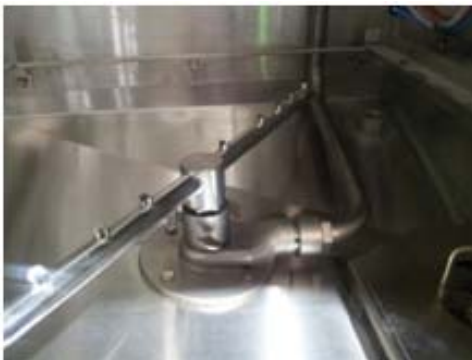
Spray arm, base w/thumb screws