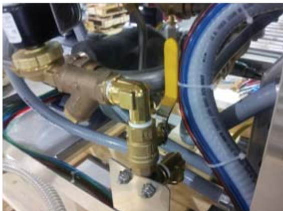
Showing 1/2" female pipe inlet, ball valve, y-line filter, H2O solenoid