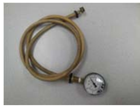
Spray arm pressure tester # 088-1048