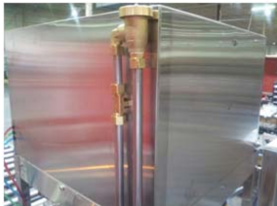
ASSE approved vacuum breaker (backflow preventer)