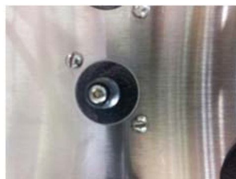
Chemical alarm barb adjusting screw *

TYPE OF CHEMICALS —Use only commercial grade low-energy chemicals. For proper operation, use non-foaming detergents and buffered sanitizer. Do not wash gold, pewter, silver, or silver-plate with chlorine based sanitizers. High concentrations of chlorine sanitizers and caustic detergents will cause damage to metals and welds. Do not exceed 50 parts-per-million (PPM) "free" or available chlorine. Any setting higher than 50 ppm will be dependent on local health requirements, however, the increased chlorine will result in higher corrosion of metal parts. The resulting damage from overusing chlorine is not covered under the ADS warranty. Purpose-built ware-washing dispensers are needed to properly meter chemicals for wash and rinse. These dispensers are included with this model. Manually adding industrial chemicals to the dishmachine is unsafe and not approved.