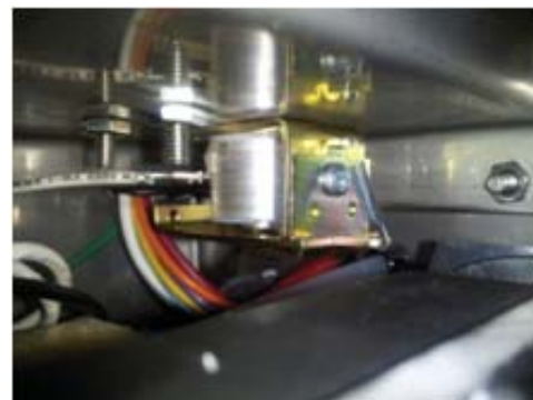
Left is Start Relay, right is Heater Relay Left is Drain Relay, right is Heater Contactor Optional buzzer for low chem. alarm