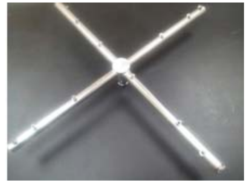
Cross arm for light glassware (081-6212)