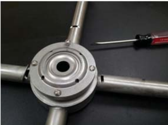
Remove 4 screws and lift top shell