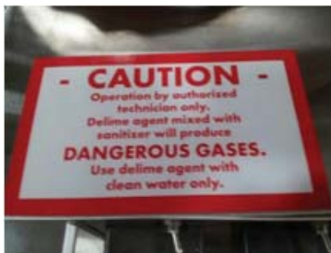
Warning decal about mixing chemicals