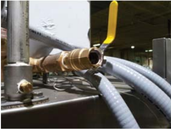
Showing final rinse mixing chamber, hot-water inlet to HT-25

#6 HOODS —Follow all local plumbing and mechanical codes. IMC 2012, section 507.2.2 requires Type II hoods for all commercial dishwashers except where the heat and moisture loads are incorporated into the building's HVAC systems or dishwashing equipment designed with separate heat and moisture removal systems. A door-type, single-rack, hot-water sanitizing dishwasher is rated at 4770 Btu/h by table 5E, ASHRAE Research Project #1362, 8/5/2008. ADS DOES NOT SPECIFY BUILDING HVAC VALUES.