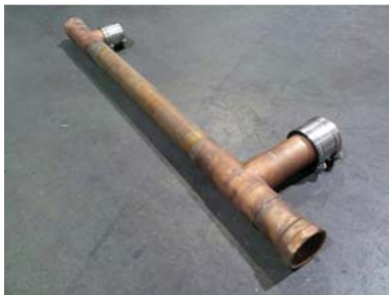
HT-25 drain manifold with "no-hub" connectors