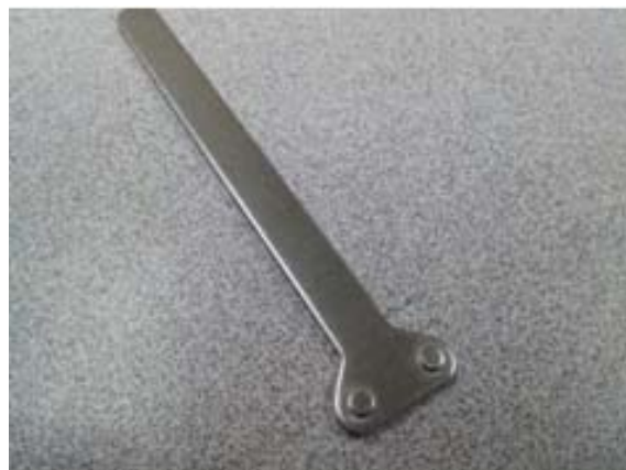
Cam adjusting tool

TESTING FOR TEMPERATURE —For high temp sanitizing, the measurement is taken at the manifold for a minimum of 180°F, NOT in or at the sprays. If tapes are used to verify temperature, then only 165°F labels should be used, this is the temperature required on the surface of the plates--NOT 180°F. This is according to the NSF/ANSI Standard 3 test protocol.