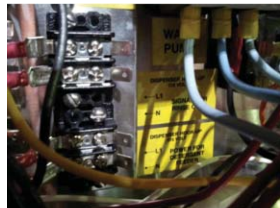
Showing dispenser signal connection terminals

NOTE: Before turning on the water, if the chemical dispenser has not been installed, plug the probe and chemical delivery holes in the wash tank and plug the mixing chamber injection ports.