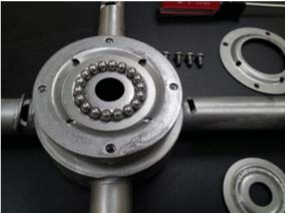
Top race removed, ball bearings for replacement