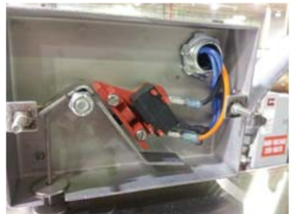
Showing "float" switch that controls fill water & heater

The wash temperature is maintained by a sustainer heater. Record tank temperature during the initial tests. There are two gauges mounted under the control box. Gauges are marked Wash/Final Rinse. Wash tank temperature should be 140°F for chemical sanitizing and 160°F for hot water sanitizing. If tank temperatures are low, increase by adjusting the heater thermostat located behind the wash motor.*