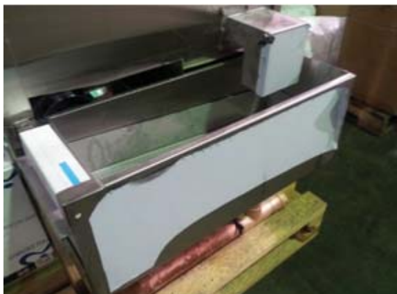
Scrap box and 2" drain manifold attached to pallet for shipping

ADS provides a 2" copper drain manifold for the tank and scrap box, the manifold is shipped strapped to the pallet of the dishmachine. After installation, attach the drain manifold using the rubber "no-hubs" on the manifold. To prevent clogging, run drain lines as straight as possible. Do not plumb with tight radius elbows or 180° bends. Use of floor sinks for drains can cause flooding. Do not use reducing adapters for drain lines, always use 2" diameter pipe or larger. Always run gravity drain lines downhill.