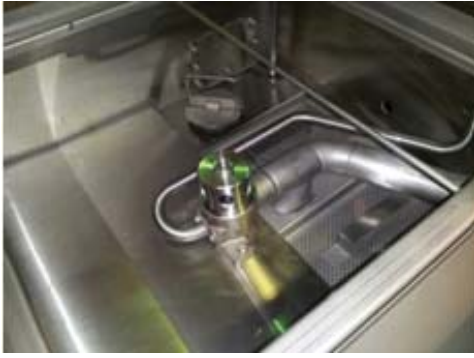
Showing spray arm base & transfer tube