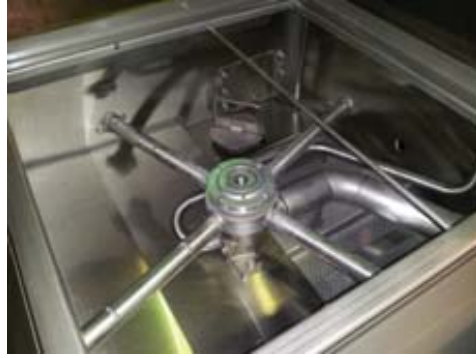
Wash arm w/bearing installed on base