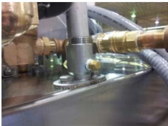
Mixing chamber with two 1/8" pipe threaded port