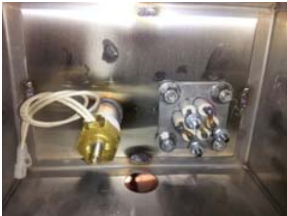
Showing thermostat and sustainer heater terminals*

To operate, connect the breaker for main power and turn "ON" the dishmachine master switch. Water will automatically fill to an operational level. After several cycles when final rinse water increases the tank water level, the tank water will overflow to the scrap box. Place a rack of dishes in the machine, close the door and the cycle will begin.