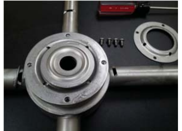
Remove top shell, exposing top bearing race