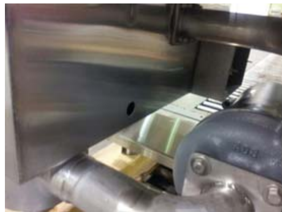
Showing 7/8" detergent probe hole behind pump motor

ADS provides two (2) ports, 1/8" IPS female threads in the final rinse mixing chamber for dispenser check valves. Probe hole (7/8") is provided in the wash tank for probe installations (install probe before operating the machine). Detergent hole (7/8") is provided for bulk-head fitting (install fitting before operating machine).