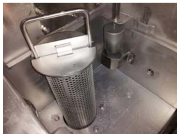
Pump filter in drain sump