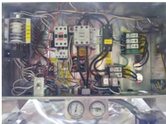
Showing HT-25, single-phase control box

Before powering up the machine, CHECK ALL ELECTRICAL SCREW TERMINALS in the control box on top of the machine and the heater box. Screws can loosen in transit. Loose connections on high amp load terminals will cause wire burning and component damage during operation and will not be covered under ADS warranty. The term “Clean Circuit” means the electrical circuit breaker supplies no other devices, motors, machines, or lights.