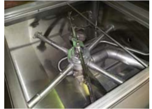
Final rinse arm twisted into transfer tube

Verify incoming water temperatures and final rinse pressure (20 psi during final rinse). Remove any of the white protective film from stainless surfaces such as doors or panels.