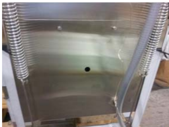
Showing back of tank, 7/8" detergent bulkhead fitting hole

ADS provides two (2) ports, 1/8" IPS female threads in the final rinse mixing chamber for dispenser check valves. Probe hole (7/8") is provided in the wash tank for probe installations (install probe before operating the machine). Detergent hole (7/8") is provided for bulk-head fitting (install fitting before operating machine).