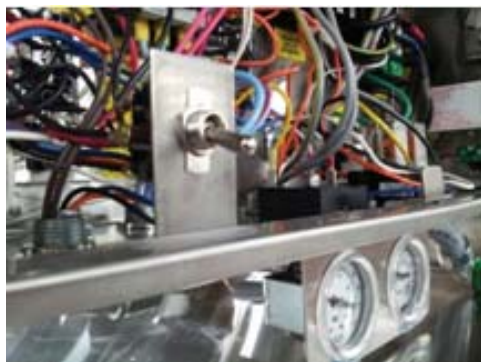
De-lime switch in HT25 control box

Let the machine run long enough to return the inside of the machine to the appearance of shiny metal surfaces. Then empty and refill the tank with fresh water. It is best to de-lime more often with milder acid solutions than waiting until there is heavy build up of white minerals, then trying to remove the build up with very strong acid concentrations. Using too strong of an acid solution or running it for very long periods of time will erode the metal of the impeller because it is spinning in the acid solution. If the final rinse arms are clogged with mineral deposits, remove from the machine and soak them in a pan with lime remover.