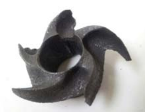
Impeller damaged from high acid solution