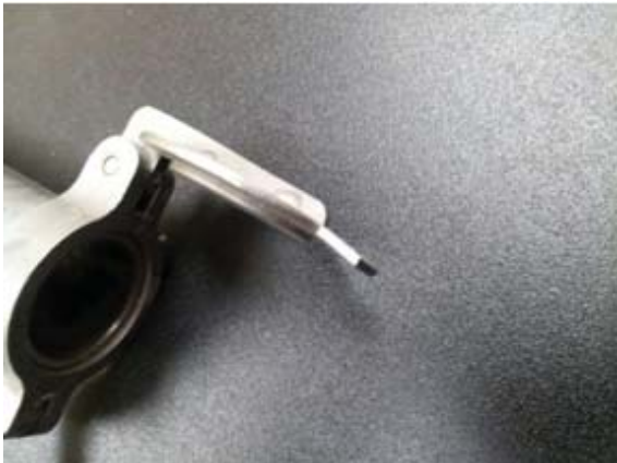
Tab on endcap bent inward, causing loose fit

Showing repair of loose end cap when tab on the cap has been forced close or bent on material such as seeds or tooth picks.