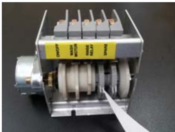
Showing HT-25 cam timer, arrow points to deter cam