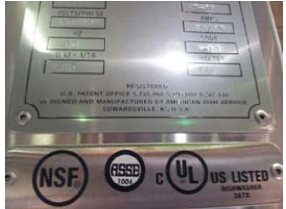
Data plate information and listing marks