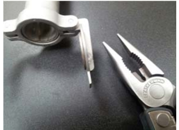
Straighten tab in line with the coin edge to tighten