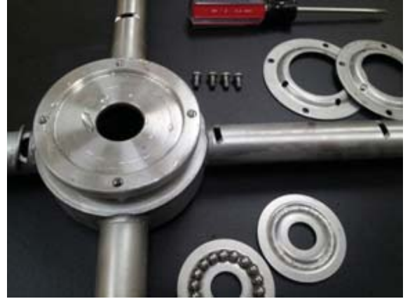
Races are interchangeable, capture shells are also

Showing repair of loose end cap when tab on the cap has been forced close or bent on material such as seeds or tooth picks.