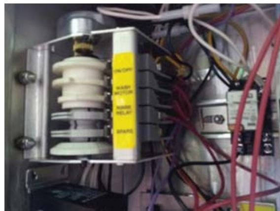
Cam timer with 3 fixed operational cams, 2 adjustable