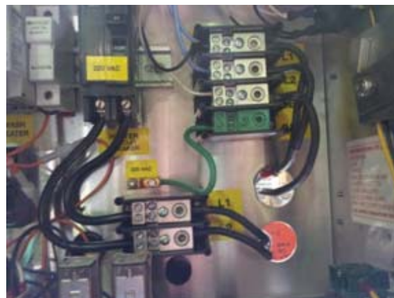
Main distribution blocks for two incoming circuits, 30/60a