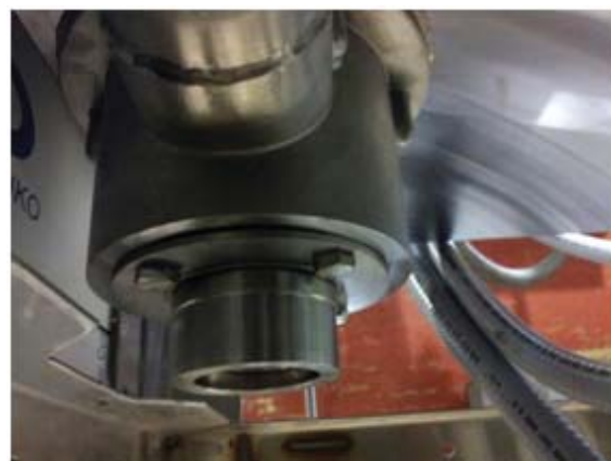
Drain sump connection for copper drain, bottom of tank