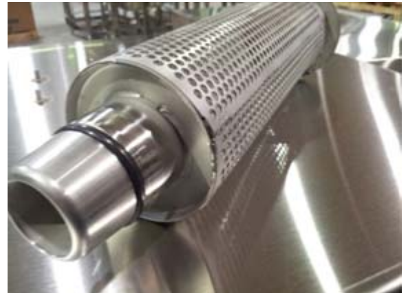
Pump filter and drain plug, note O-ring seal