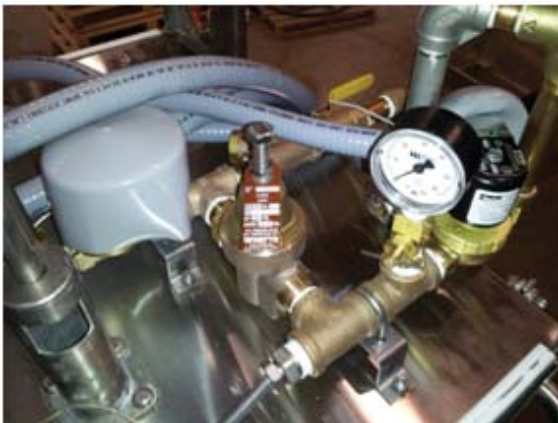
Showing PRV, ASSE approved air-gap, final rinse gauge

Flush the building's water lines before connecting to the dishmachine to avoid fouling the inlet water solenoid. For high temp sanitizing this inlet water line must come from a stand-alone booster heater. Connect \frac{3}{4} " MPT water supply line to a 12kW booster and a \frac{1}{2} " MPT line to the top of the dishmachine inlet manifold when using a stand-alone booster. The requirement at the dishmachine is 180°F minimum at 20 PSI during final rinse, with a demand of 47.2 GPH. The pressure is measured at the pressure gauge mounted next to the pressure reducing valve in the inlet plumbing on top of the machine's hood. To adjust pressure, turn adjustment screw atop the valve counter-clockwise to decrease pressure.