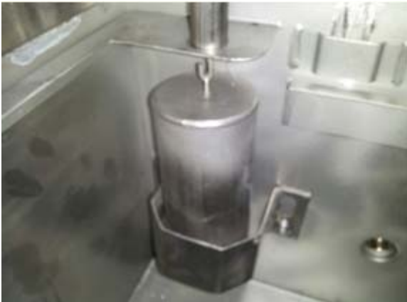
Wash tank float and tank overflow

“FLOAT” AND SWITCH—the float will not actually float. It is heavier than water but it weighs less in water than in air. This difference allows the return spring in the float switch to push out against the lever, which raises the float in water. In air the float weight will overcome the switch spring tension and drop down. The float switch (#291-3014) is specifically made with this spring tension so the water control system will operate correctly. Do not replace with a timer switch even though they look the similar.