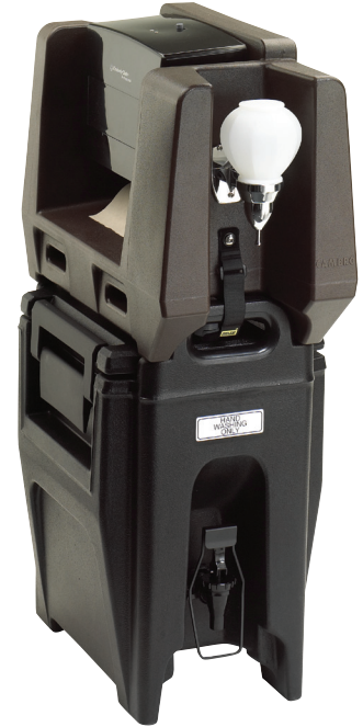
Ultra Camtainer with HWATD