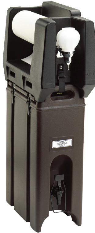
Camtainer with HWAPR