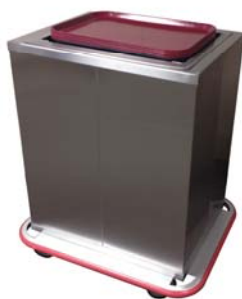
Enclosed cabinet—lift entire lowerator assembly out of cabinet to access the springs