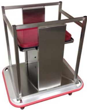
OTD Open Tray Dispenser

Email: technicalservice@carter-hoffmann.com