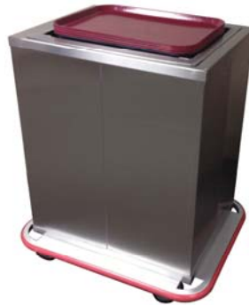
ETD Enclosed Tray Dispenser