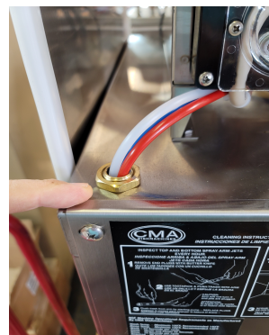
Chemical lines through new tube