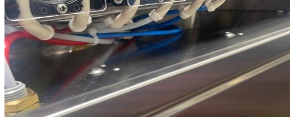
Detergent and Rinse Additive holes plugged