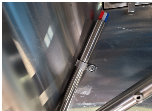
Clamp on stainless steel tube