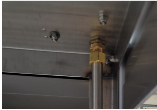
Compression fitting with stainless steel tube