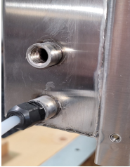
Sanitizer line before and plugged