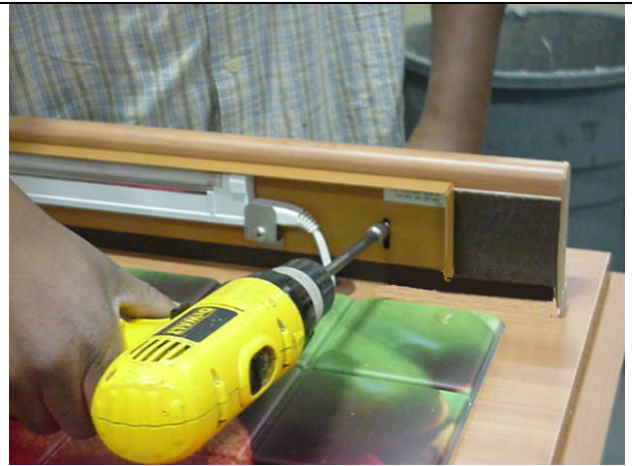
25. CENTER THE LIGHT ASSEMBLY ON THE BOTTOM SIDE OF THE PURSERAIL (LEFT TO RIGHT) AND COVER THE LAMINATE BY 1/4" ON THE BOTTOM WITH THE FRONT EDGE OF THE LIGHT SHIELD.