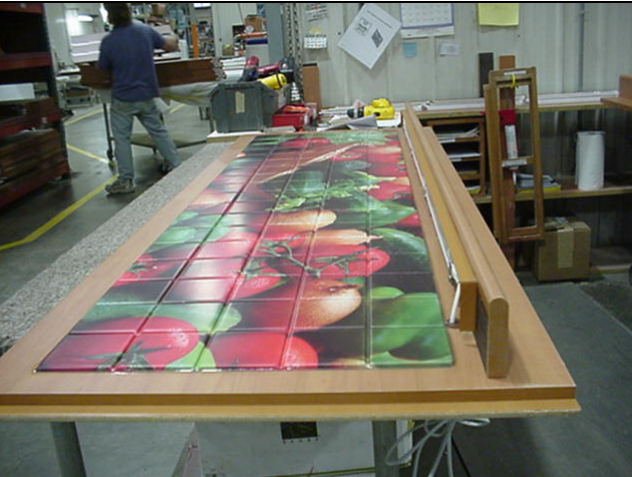
22. ALIGN THE NEW PURSERAIL TO PENCIL MARKS ON PANEL.