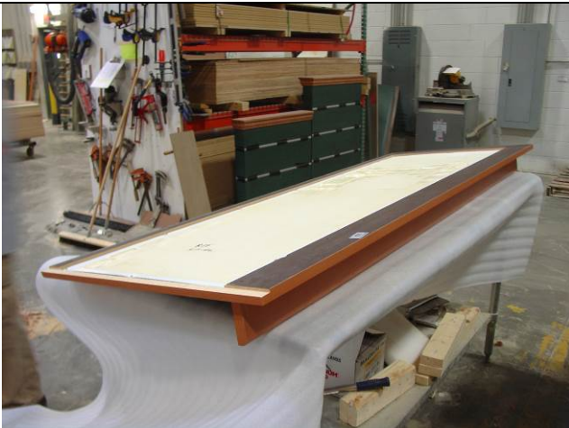
12. TURN PANEL OVER AND PLACE FACE DOWN ON PADDED WORK SURFACE.