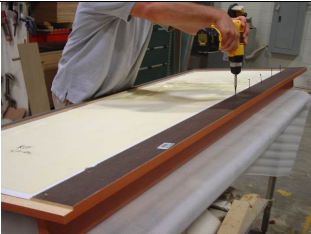
24. TURN THE PANEL OVER AND INSERT THE REMAINING SCREWS WITH THE SQUARE HEAD BIT.