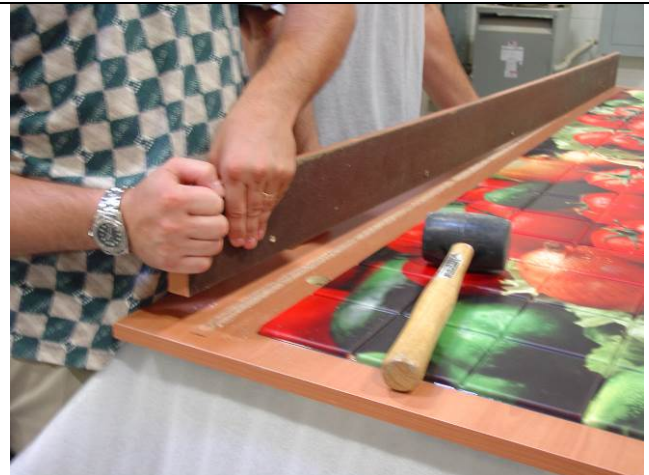
17. ONCE THE PURSERAIL IS LOOSE, PULL UP FROM ONE END AND REMOVE.