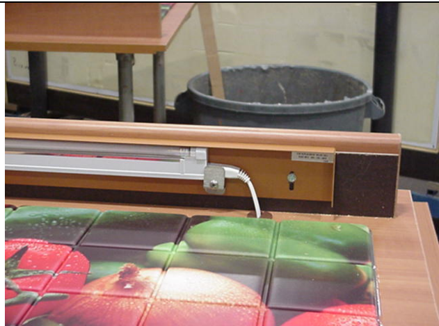
26. REATTACH THE LIGHT ASSEMBLY TO THE NEW PURSERAIL USING A 5/16" HEX HEAD BIT.