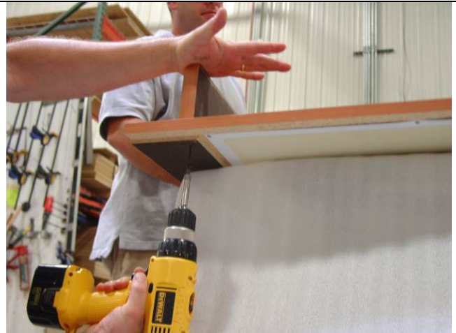
23. WHILE HOLDING PURSERAIL SECURE TO PANEL, PUT ONE SCREW INTO EACH END AND THE CENTER OF THE PURSERAIL BEFORE TURNING THE PANEL OVER.