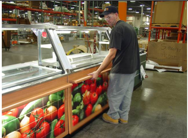
29. REINSTALL DÉCOR PANEL AND PLUG IN LIGHTS.