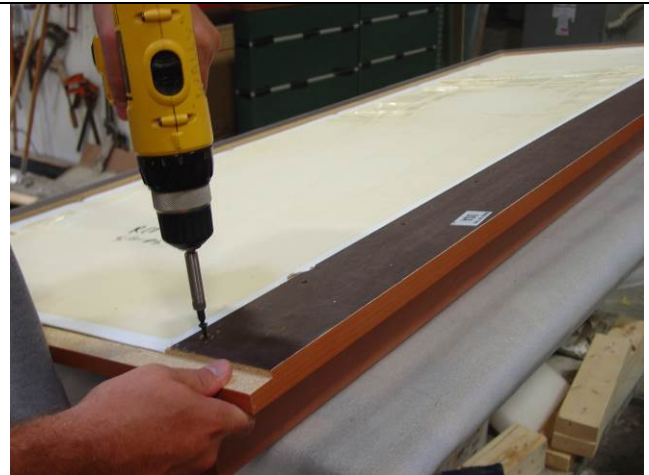
13. REMOVE SQUARE HEAD SCREWS WHICH ATTACH THE PURSERAIL. (QTY OF 12)