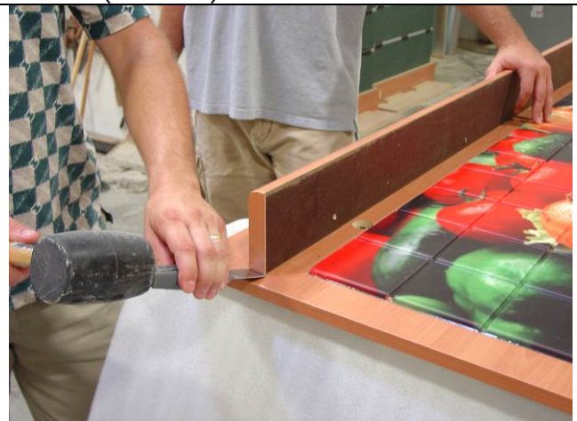
15. YOU ARE NOW READY TO REMOVE THE PURSERAIL. START AT ONE END WITH THE PUTTY KNIFE AND MALLET.