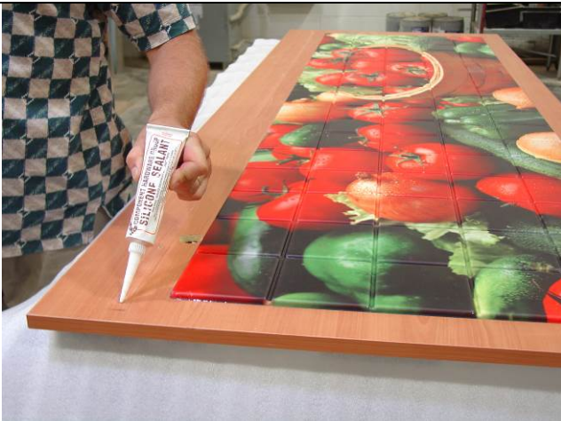
20. RUN A BEAD OF CLEAR SILICONE ALONG THE DÉCOR PANEL WHERE THE NEW PURSERAIL IS TO BE PLACED.