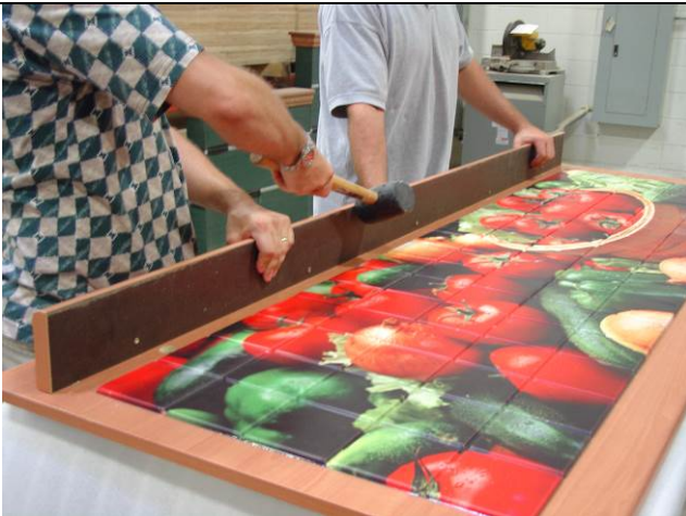
16. YOU WILL LIKELY NEED TO TAP THE PURSERAIL WITH THE MALLET TO BREAK THE SILICONE LOOSE.