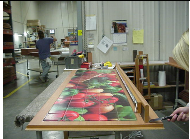
28. REMOVE ANY EXCESS SILICONE FROM TOP OF PURSERAIL WITH PUTTY KNIFE.