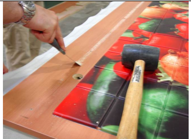
19. REMOVE THE DRIED SILICONE FROM THE PANEL USING A PUTTY KNIFE.