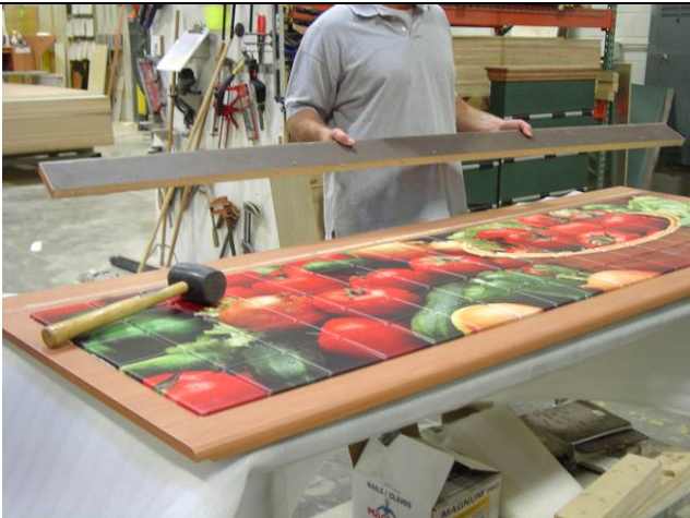
18. OLD PURSERAIL MAY BE REMOVED AND DISCARDED.