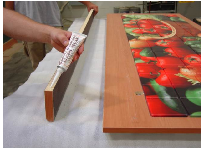
21. RUN A BEAD OF CLEAR SILICONE ALONG THE EDGE OF THE NEW PURSERAIL.