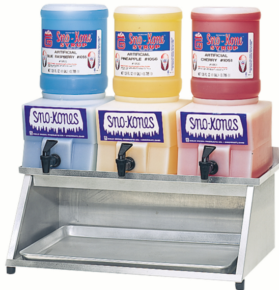
Model No. 1073