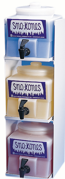
Model No. 1067