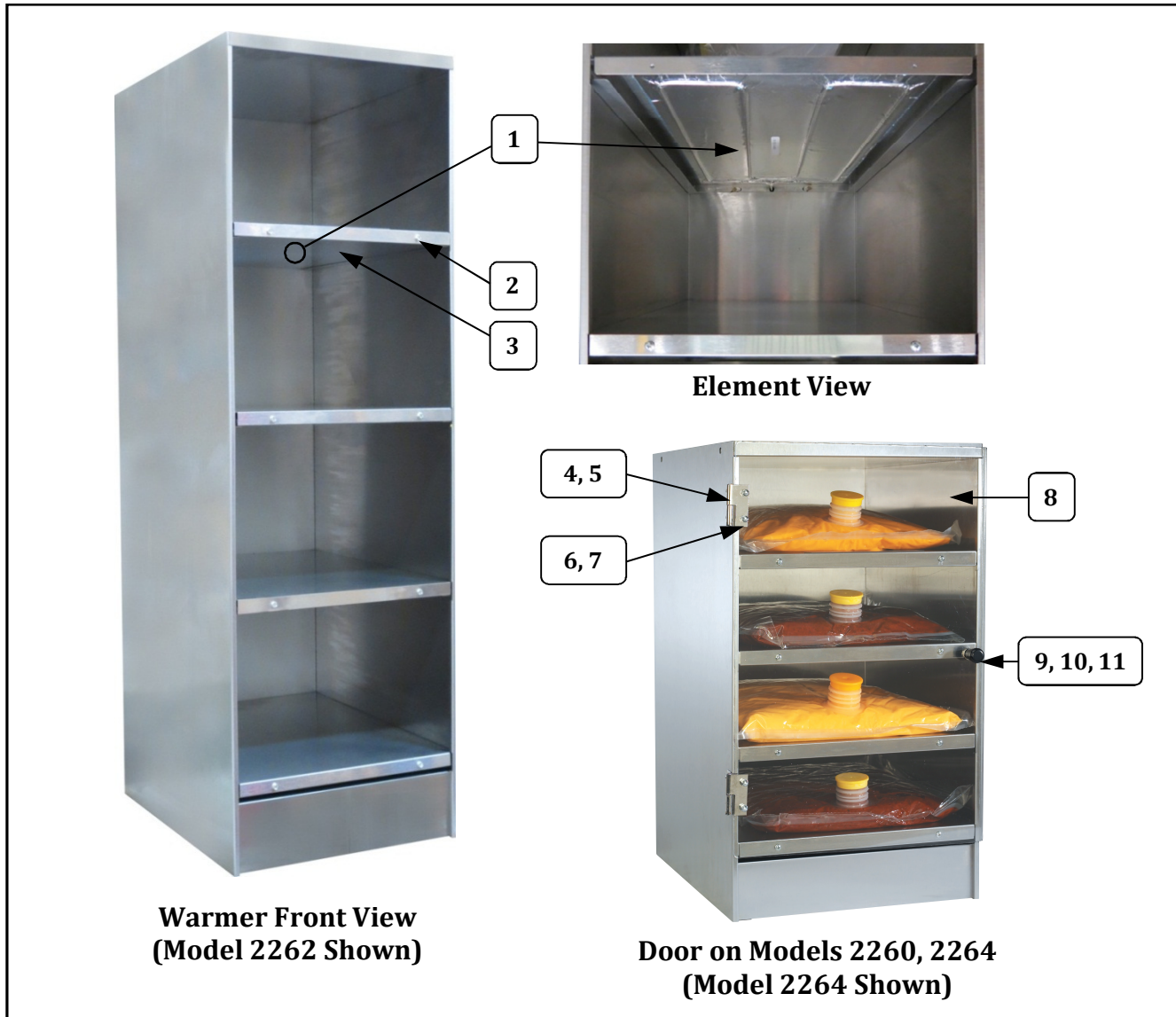
Warmer Front View (Model 2262 Shown)