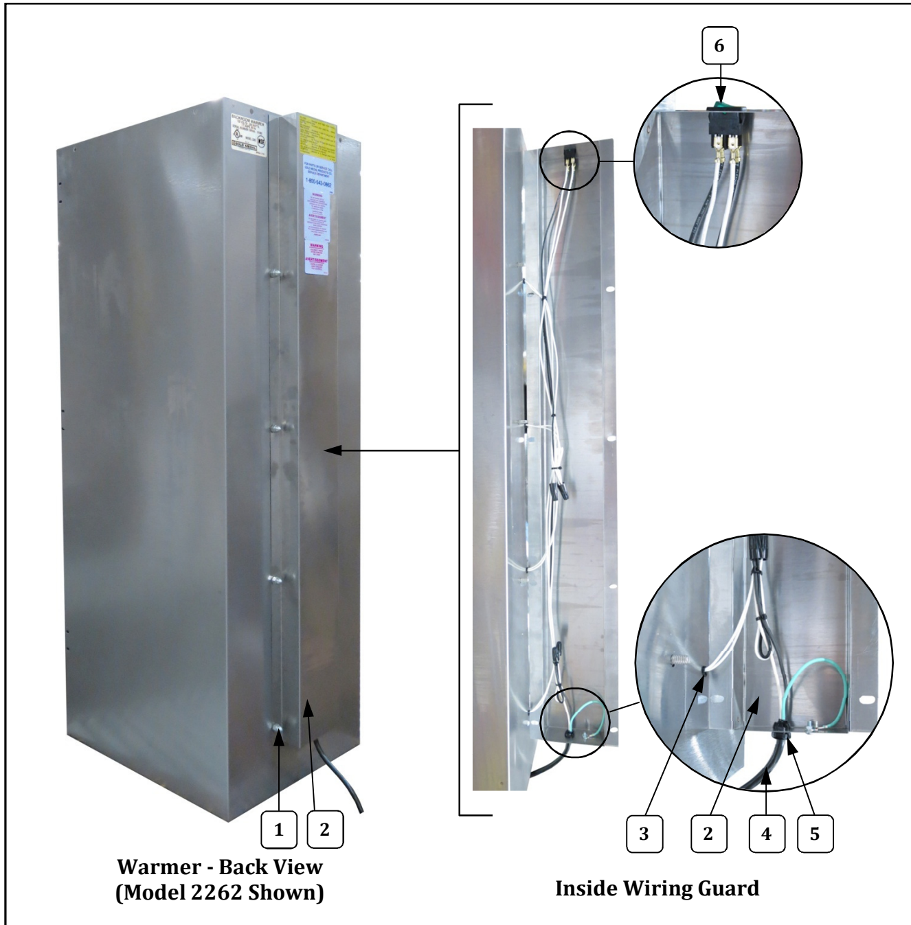
Warmer - Back View (Model 2262 Shown)