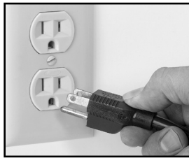
Fig. 6-1 Correct

THIS MACHINE IS PROVIDED WITH A THREE-PRONG GROUNDING PLUG. THE OUTLET TO WHICH THIS PLUG IS CONNECTED MUST BE PROPERLY GROUNDED. IF THE RECEPTACLE IS NOT THE PROPER GROUNDING TYPE, CONTACT AN ELECTRICIAN. DO NOT, UNDER ANY CIRCUMSTANCES, CUT OR REMOVE THE THIRD GROUND PRONG FROM THE POWER CORD OR USE ANY ADAPTER PLUG (Fig. 6-1 and Fig. 6-2).