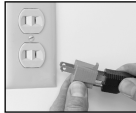
Fig. 6-2 Incorrect