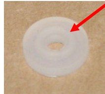
Spout Handle 990085400