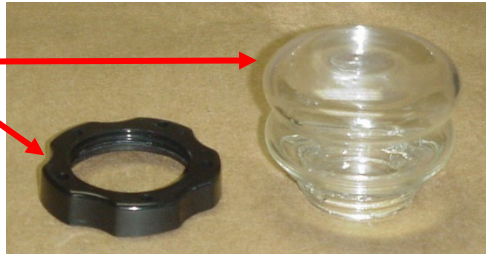
Water Window Gauge Gasket 990092500