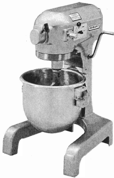
MODEL A120T MIXER