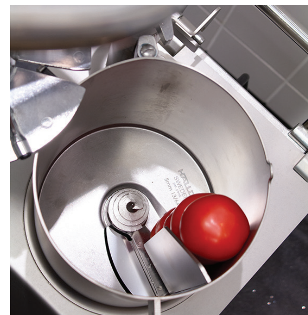
Figure A - Stacking Feed Cylinder