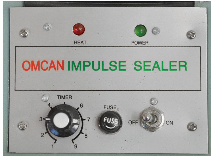
Fig. 1 - Diagram of the control panel for the impulse sealer