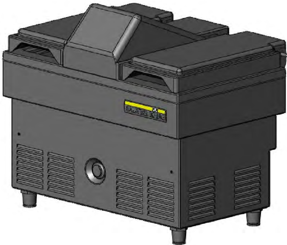
MODEL SKPS3/C3 (W/ ELECTRONIC CONTROL)